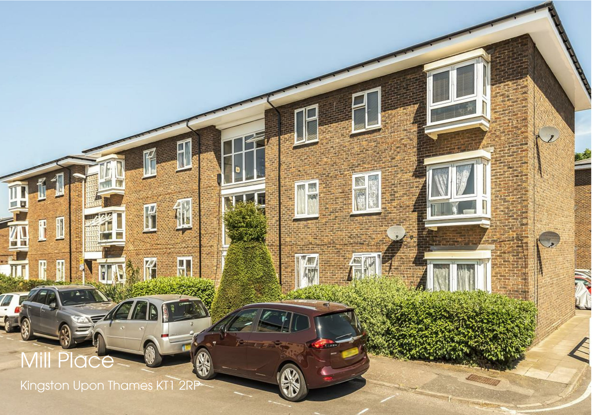
Mill Place Kingston Upon Thames KT1 2RP